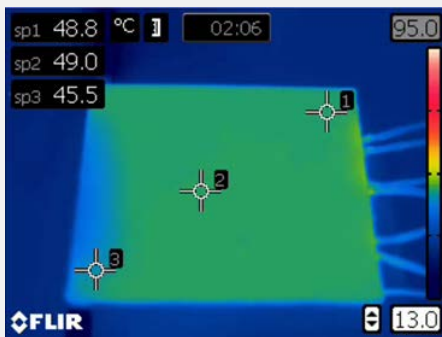
10 cm x 10 cm FlatCool at 120 W